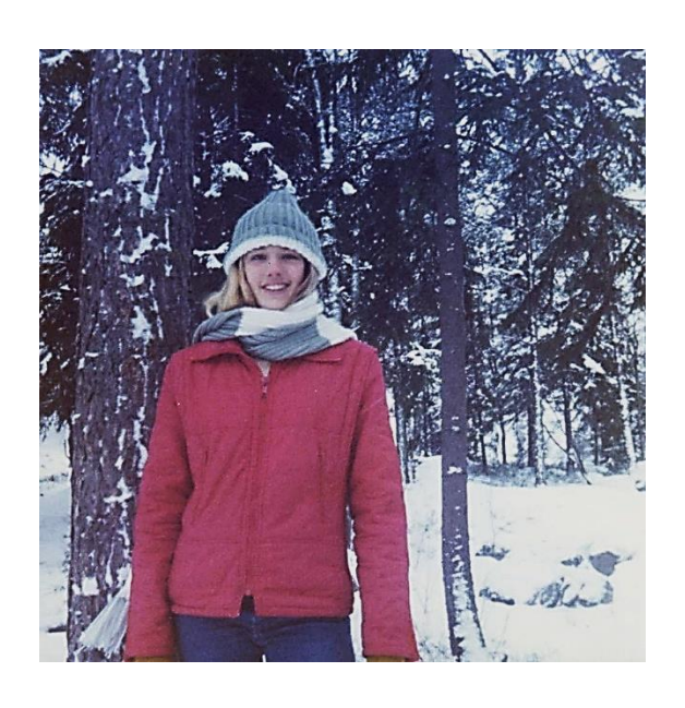
My daily walk through the forest to school Family Photos from 1976 (below)