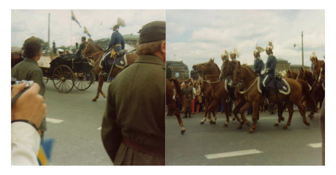
and in 2007... not much has changed