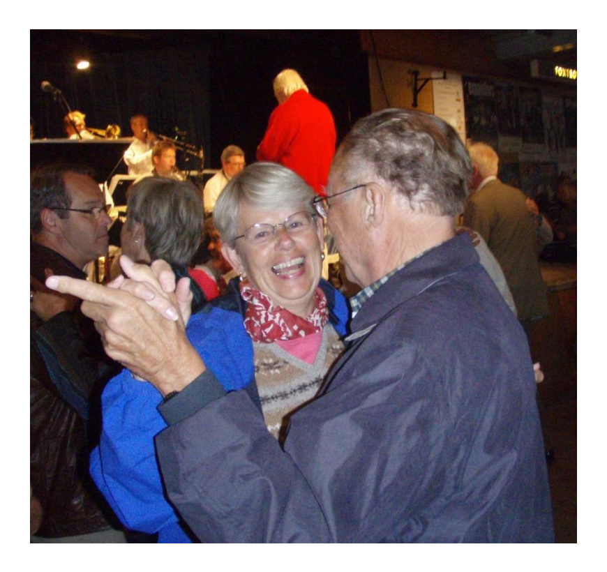
July 31, 2007 (Tue) - Drottningholm Island: