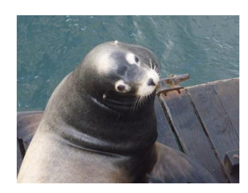
Day 8, Sat, Nov 26, 2011 - Cape Blanco

Along the way I watched the sea lions (the local seals) as they put on a show for me at the nearby fish mongers docks. A few stops for scenic overlooks, more seal watching, fruitless whale watching, a hike down to Devils Spout, a stroll in historic Florence and Myrtlewood shopping led us to our campsite at <u>Bullards Beach</u>. We caught the tail end of a gorgeous beach sunset before finding a camp (in the dark). No rain or wind at all today, even though the forecast called for gale wind and 21 foot seas starting at 7 pm tonight.