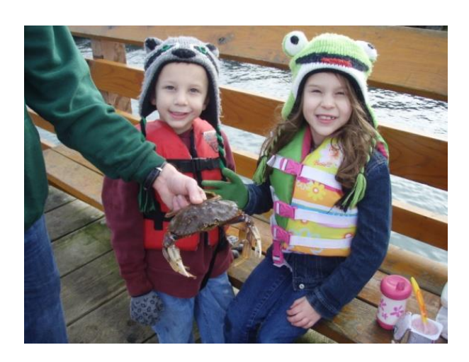
Day 9, Sun, Nov 27, 2011 – Harris Beach

depending on how the crab population is doing). If we lived here, we would definitely be crabbers! Crabpots sell for about $25-40, annual license is minimal but you do have to buy chicken as bait. A friendly family we met on the dock filled us in on all the rules while we ate lunch with them on the dock. We bought our crab from the local sidewalk vendor while they had a few of their caught crabs steamed by the same vendor for free. After a late crab lunch we drove down to the South Bandon Jetty and walked down to Face Rock and watched local seals "watching" us from the surf. A delightful afternoon with a short drive to <a href="Cape Blanco campground">Cape Blanco campground</a> for the night. We parked at the lighthouse overlook but the clouds hid most of the sunset. Clam Chowder and grilled cheese in our motor rig for dinner!